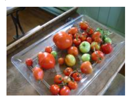
Ready for tasting at Open Sunday